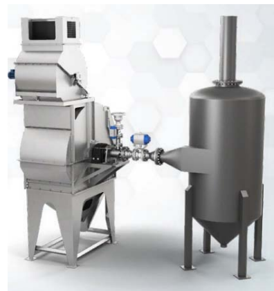
TOMRA Steam Peeler

With our Partner TOMRA we were able to present the newest state of the art optical sorting Technology for whole and sliced potatoes and other vegetables as also our steam peeling solutions.