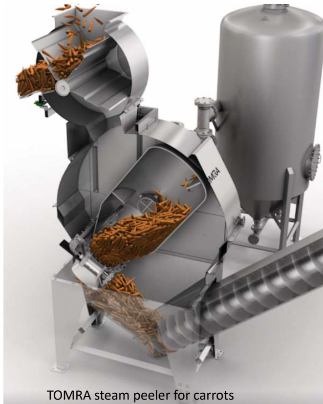
TOMRA steam peeler for carrots