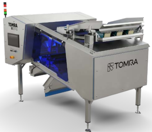
The new TOMRA 5C