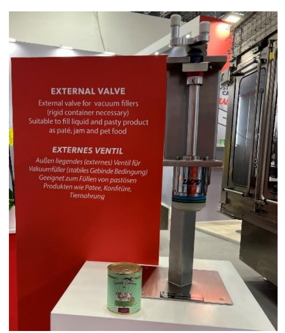
Example of an "external" filling valve for vacuum fillers.