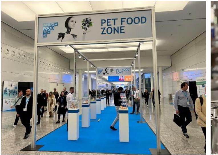
At the new Pet Food Zone, we presented our readysealed pet food cans.