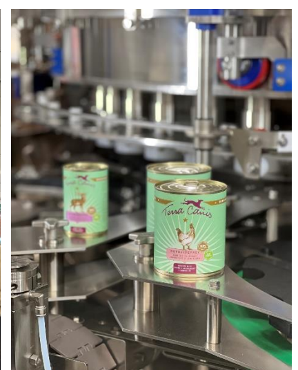
Love to Detail.