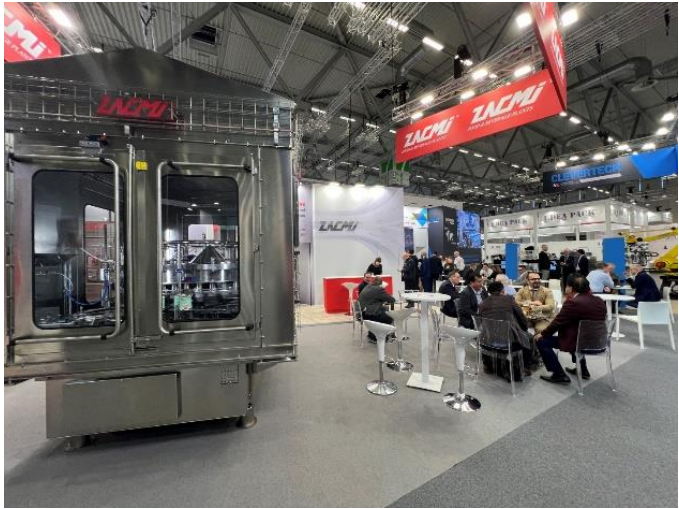
Clean design and complete housing for Automatic cleaning.

Filler-seamer combination and examples of different filler principles.